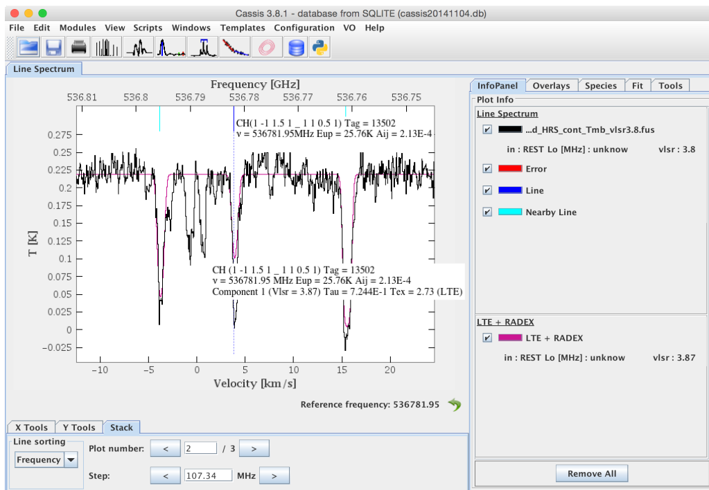
Fig. 1. A screenshot of the main CASSIS window, showing an observed spectrum in black overlaid with a synthetic spectrum in pink. The blue lines indicate the position of the transitions of the species of interest, here CH. A click on these lines display spectroscopic information. Clicking on any modelled line also gives the excitation temperature, T_{\text{ex}} , used to produce the model, as well as the opacity, which depends on the assumed column density.