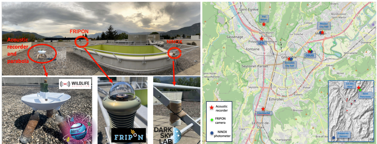
Fig. 1. Left: The roof of OSUG equipped with the NINOX photometer, the FRIPON all-sky camera and two acoustic recorders, one being at the focus of a 40cm 3D-printed parabola Right: Map of the Grenoble metropolitan area