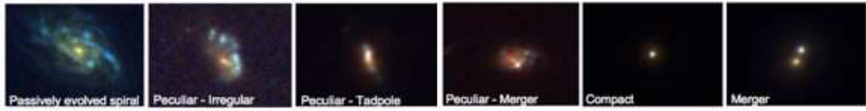
Fig. 2. B-V-z color images of galaxies representative of the six morphological classes used in this study. From left to right : passively evolved spirals, peculiar/irregulars, peculiar/tadpoles, peculiar/mergers, compact galaxies and obvious mergers.

In Fig. 2 we show, for each morphological class, a three color image of a representative galaxy.