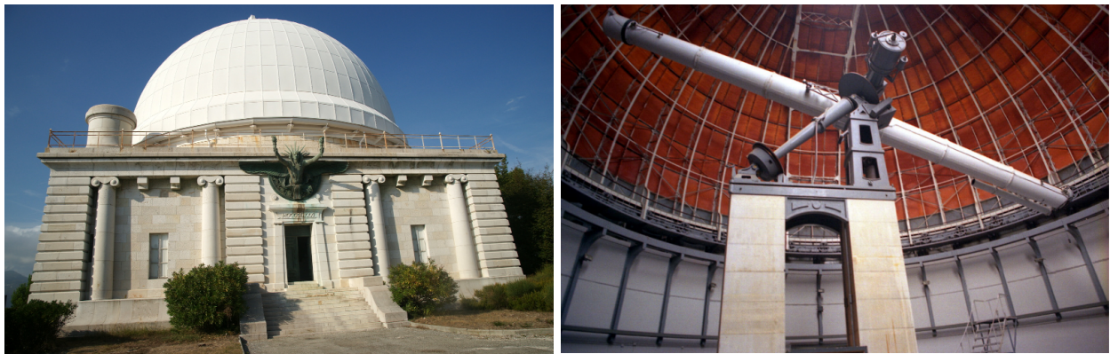
Fig. 1. Left : Great dome of the Nice observatory, SSOCA's Sun. Right: Large refracting telescope inside the dome.

beyond Saint-Tropez when the sky is clear, through the Cap d'Antibes and the bay of Cannes. This offers the possibility to place the model planets in strategic locations from which the observatory can be seen, and that can be recognised from the observatory. Fig. 2 shows the places we foresee at the moment. The four terrestrial planets will be in Nice, and the four giant planets outside the city, at mountain tops or by the sea, all in spots accessible after a nice and easy hike.