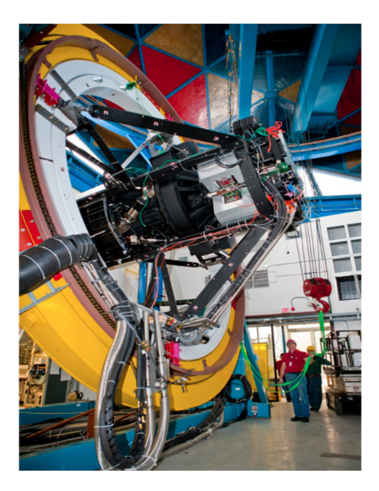
Fig. 1. DECam mounted on the Telescope Simulator at Fermilab in early 2011